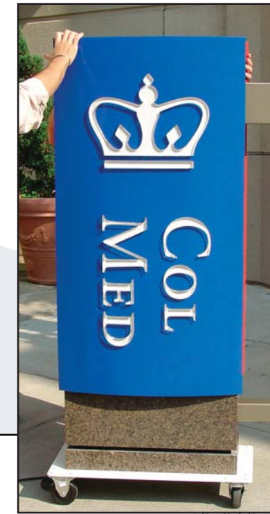
Columbia Presbyterian Medical Ctr. New York, New York