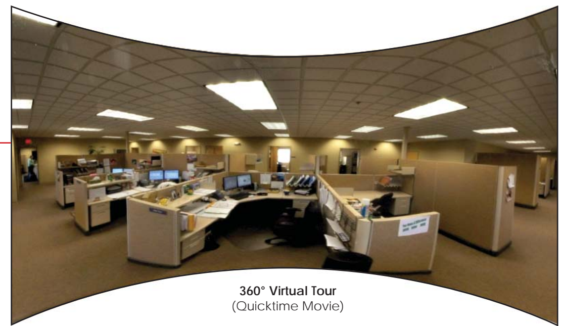
360° Virtual Tour (Quicktime Movie)